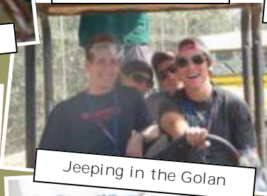
Jeeping in the Golan