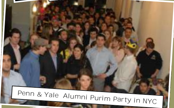
Penn & Yale Alumni Purim Party in NYC