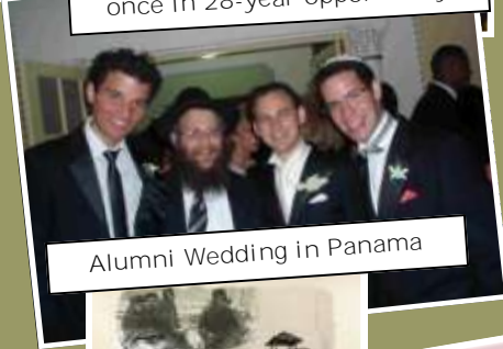
Alumni Wedding in Panama