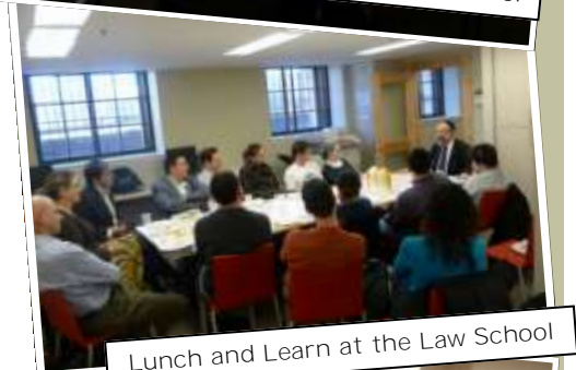
Lunch and Learn at the Law School