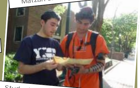
Students wrap Tefflin on Locust Walk