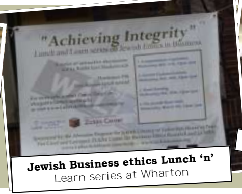
Jewish Business ethics Lunch 'n' Learn series at Wharton