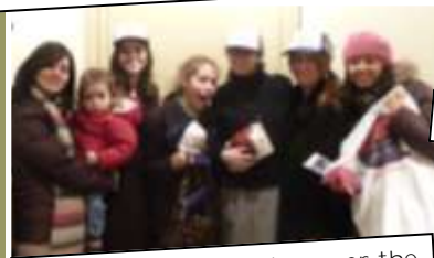
Early morning blessing over the sun at the Franklin institute once in 28-year opportunity