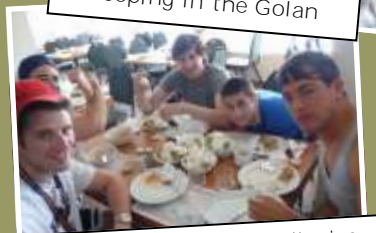
Egg consumption contest in Tiberius