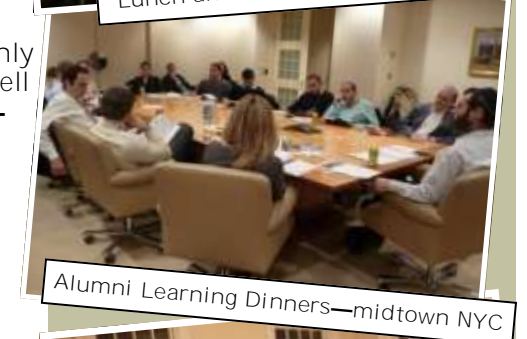
Alumni Learning Dinners—midtown NYC