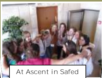
At Ascent in Safed