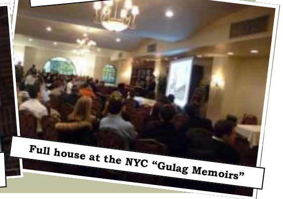
Full house at the NYC "Gulag Memoirs"