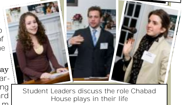
Student Leaders discuss the role Chabad House plays in their life