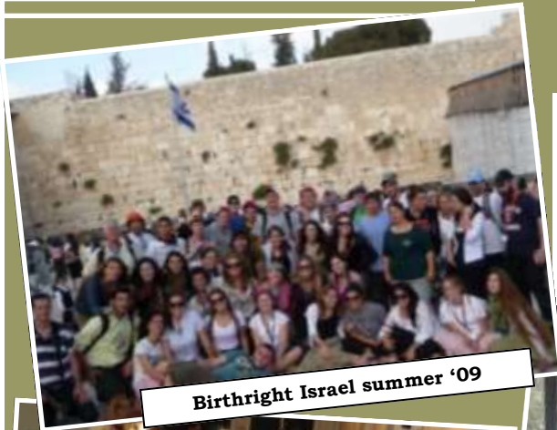
Birthright Israel summer '09