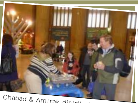
Chabad & Amtrak distribute hot latkes and Menorahs at 30th St. Station