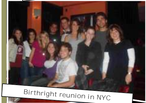
Birthright reunion in NYC