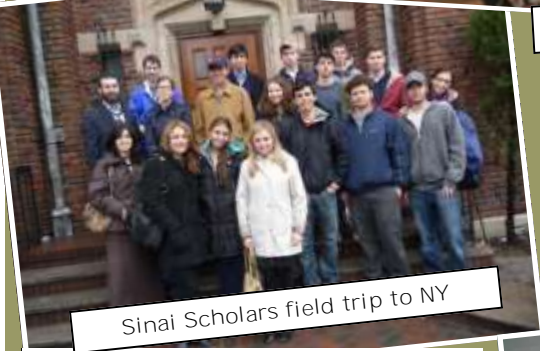
Sinai Scholars field trip to NY